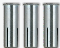
SF Drop In Anchor